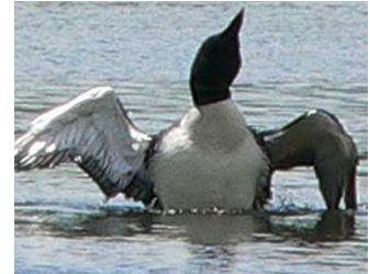
Loon on Saturday Pond by Marie Reese 2006

The three states in the continental U.S. with the most Common Loons are Minnesota (more than 10,000 adults), Alaska (between 8,000 & 13,000) and Maine (over 4,000 adults).